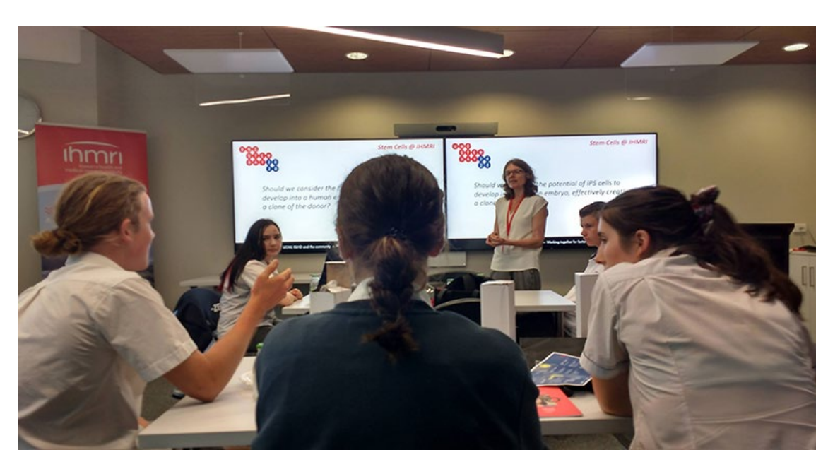
UniStem Day at The University of Wollongong