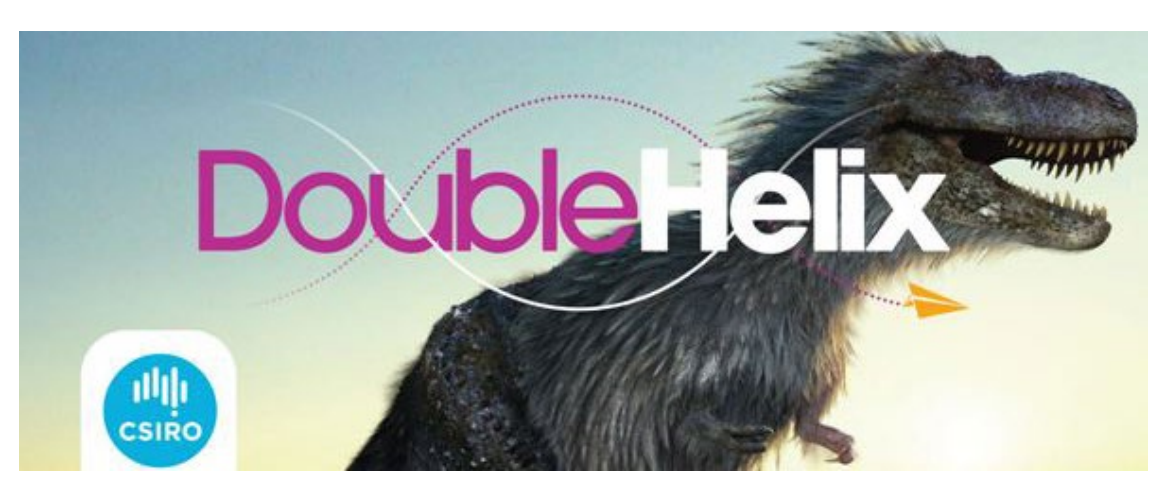
How do you diagnose a dinosaur?......